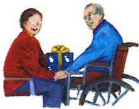
Remember our Shut-ins